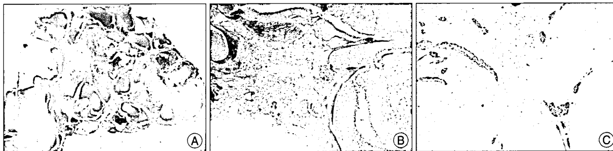
Fig. 3. Lower magnification shows variable sized dilated vascular channels with thin or hyalinized wall, which are lined by flattened endothelial cells and contained blood clots or organizing thrombi. Focal fibrotic areas are mixed with blood vessels (A). Fibrotic areas show dilated vessels and peripheral nerve fibers (B). The peripheral nerve fibers are well documented by S-100 immunostain (C).

toms as urinary symptom, muscle weakness or paresthesia.