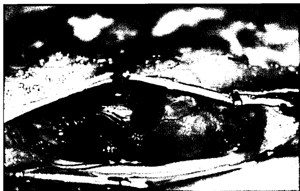
Fig. 2. Intraoperative image showing the 14 × 10 mm berry-like tumor. A rootlet remains adherent to the tumor disappearing inside its capsule.