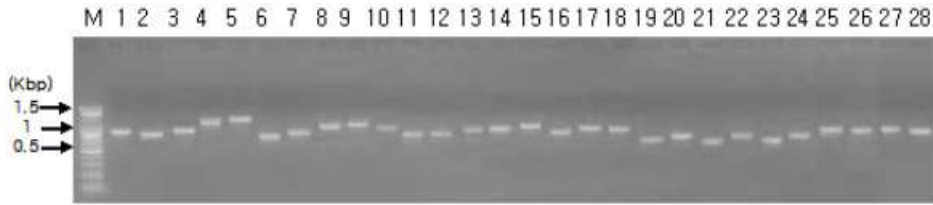
Fig. 1. PCR for making probes from chromosomal DNA. M: 100 bp DNA ladder marker, lane 1: MGG00141, lane 2: MGG00239, lane 3: MGG 01563, lane 4: MGG01674, lane 5: MGG02348, lane 6: MGG03406, lane 7: MGG03736, lane 8: MGG04855, lane 9: MGG04899, lane 10: MGG05009, lane 11: MGG05044, lane 12: MGG05190, lane 13: MGG05595, lane 14: MGG05746, lane 15: MGG06024, lane 16: MGG06707, lane 17: MGG06878, lane 18: MGG07375, lane 19: MGG07567, lane 20: MGG07848, lane 21: MGG08309, lane 22: MGG08970, lane 23: MGG09931, lane 24: MGG10277, lane 25: MGG10410, lane 26: MGG11025, lane 27: MGG14069, lane 28: MGG14400.