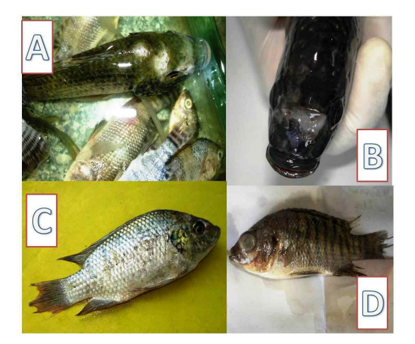
Figure 1. F. columnare / M. tilapiae naturally infected Nile tilapia showing marked skin ulcerations at the frontal head region (A); typical hole in the head like lesion with marked liquefaction of the underlying frontal tissues (B); F. columnare / M. tilapiae naturally infected Nile tilapia showing marked signs of fin rot (C); F. columnare / M. tilapiae naturally infected Nile tilapia showing marked signs of fin rot with severe corneal opacity due to the myxosporean spore invasion (D).

Clinical records also revealed that more than 75 % (38 out 50