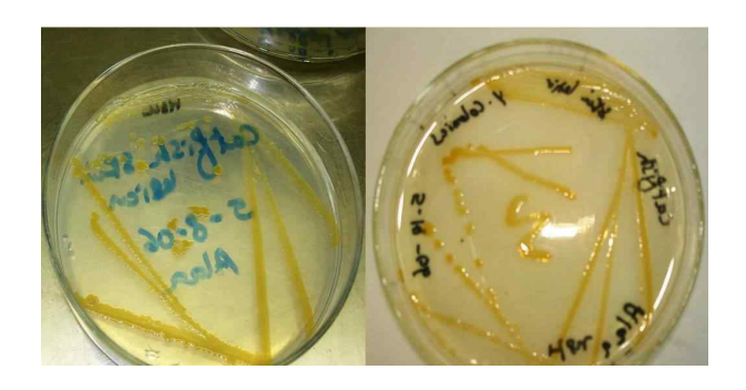
Figure 3. Yellow spreading colonies of F. columnare isolate 1 (FC1) and isolate 2 (FC2) on Hsu-Shotts Agar medium.