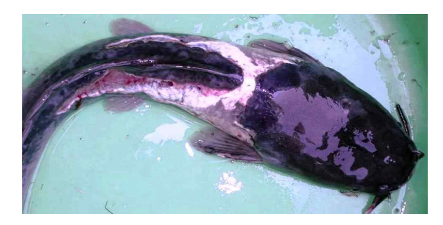
Figure 2. F. columnare naturally infected Nile catfish showing typical signs of saddle back like ulcer on the dorsal part of the fish trunk region.

fish) of the examined Nile tilapias were associated with head cysts that usually progress to frontal ulcers then penetrate deeper in the skull to form hole- in- the- head like lesion (Figure 1). Microscopical examination of unstained wet mounts made from these lesions revealed the presence of piles "hay stalks" of very long bacteria presumptive for F. columnare . Giemsa stained smears from the head lesions revealed the presence of very long rods (8- 15 \mu m). Further, Gram stained smears from the same lesions revealed the presence of large number of very long gram negative rods scattered between mucus, gills, skin and muscle tissue debris.