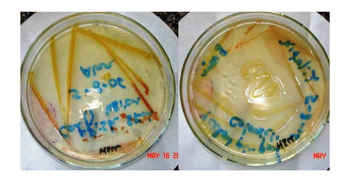
Figure 4. Species specific color shifting (chromo-shift) test: colonies of F. columnare suspect isolates turned pink after the addition of few drops of KOH 3 %.