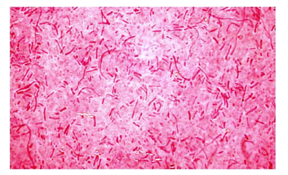
Figure 5. Gram stained smear made from the yellow colonies of F. columnare suspect isolates showing the presence of long (5-8 \mu m) pleomorphic Gram negative bacilli.

portion of the spore that encompasses four / six coils of polar filaments.