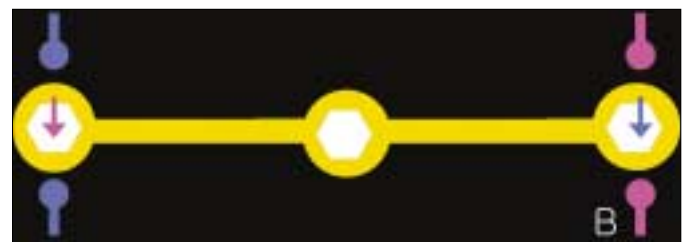
Fig. 5. Schematic drawings of the position and direction of measurement for statistical analysis. The arrows represent the screw tightening position and the round arrows represent measurement positions. A: Screw tightening of center analog and measurement of outer analogs, B: Screw tightening of left analog and measurement of right analog; screw tightening of right analog and measurement of left analog.

To simulate the one-screw test, a single abutment screw (Abutment screw Brånemark system RP; Nobel Biocare, Göteborg, Sweden) was tightened to 10 Ncm with a digital torque driver (MTG50; MARK10, Hicksville) to each of the analogs sequentially. Vertical gaps of the analogs were assessed in anterior and posterior directions for each duplicate cast. Since there was a relatively large difference in vertical gaps between the screwed analog and unscrewed analogs, only the following data were statistically analyzed: center analog screw tightening with measurement of the outer analogues (Fig. 5A), and 1 outer analog screw tightening with measurement of the other outer analog (Fig. 5B). Gap values were analyzed with the SPSS program (v 12.0) using analysis of variance and the Tukey test at a .05 level of significance.