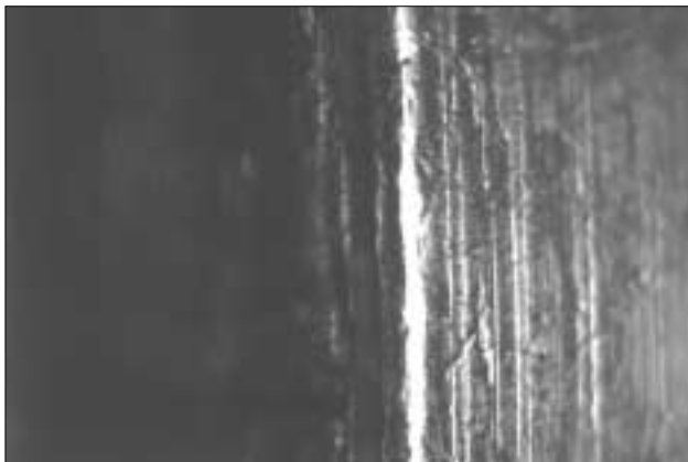
Fig. 4. Image of the vertical gap between the UCLA abutment of the reference framework and the implant analog of the experimental definitive cast.

Vertical gaps between UCLA abutments of reference frameworks and implant analogs of duplicate casts were measured with a light microscope with image processing (Accura 2000, INTEK PLUS, Deajeon, Korea) under 240\times magnification. The accuracy of the light microscope was \pm 0.1 \mu\text{m} (Fig. 4).