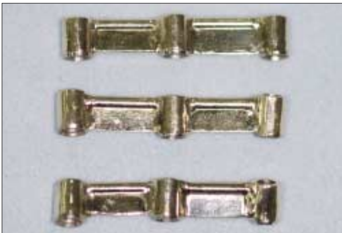
Fig. 1. Reference frameworks were waxed and cast on preliminary casts. Top: 0 degree, middle: 30 degrees, bottom: 40 degrees.

To fabricate the custom trays, 2 layers of baseplate wax spacers were placed on the assembly of the definitive cast, base former and impression copings to ensure a uniform thickness