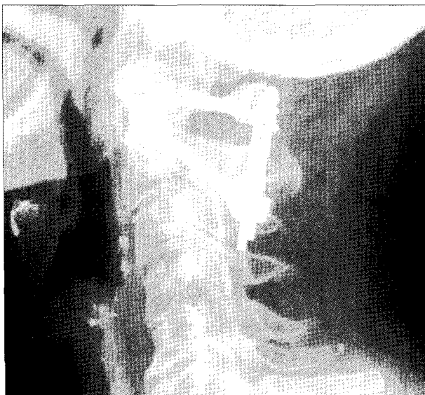
Fig. 3. Postoperative lateral cervical spine shows posterior C1-2 fixation with good alignment.

and trajectory was oriented using anatomical landmarks, as described by Harms and Melcher 7 . A contoured horse-shoe shaped rod was secured to the C-1 arch using sublaminar cables. The rod was placed into the polyaxial screw heads and secured in position. Lateral arthrodesis was performed by decorticating the exposed surfaces of the C1-2 joints with a high-speed drill and then packing cancellous iliac crest autograft over these joints (Fig. 3). The postoperative course was uneventful. The patient was neurologically completely asymptomatic in follow-up. Head rotation was reduced by approximately 30% compared to her preoperative status.