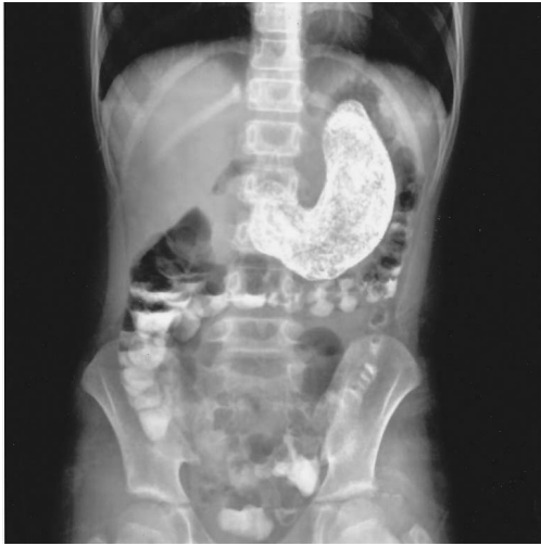
Fig. 1. Upper gastrointestinal series showing a huge intraluminal mass.