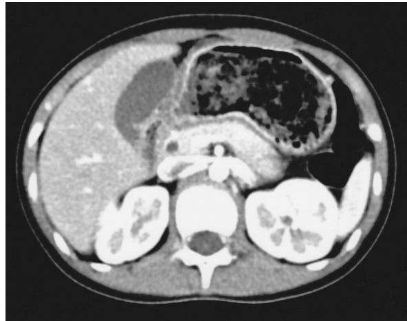
Fig. 2. Contrast enhanced abdominal CT scan showing a large intraluminal mass with entrapped air in the stomach.