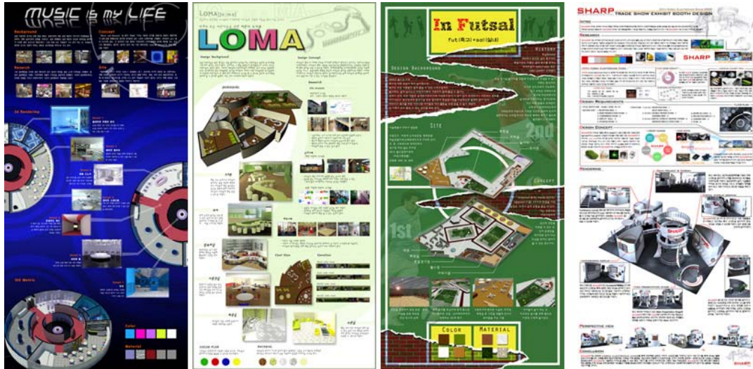
Fig.4 Presentation panel prepared by AutoCAD, Photoshop, Illustrator and 3DS Max.