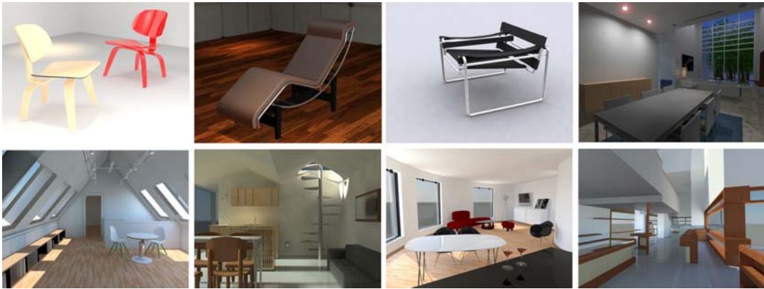
Fig. 3 Results of 3DS Max modeling course (furniture design, interior design).