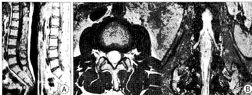
Fig. 1. Magnetic resonance (MR) image of the first case. A : Outside T1-weighted sagittal view shows mass lesion at L3-4 level. However, rechecked MR image shows mass upmigrated at L2-3 level. B : In T2 axial image, some portion of tumor show cystic change with septum formation. MR myelography showing intradural extramedullary location.

He underwent a partial laminectomy at L2-3 level for tumor removal on January 15, 2008. After a midline dural incision, the tumor was carefully dissected from the surrounding root and completely removed. The biopsy determined it to be a schwannoma.