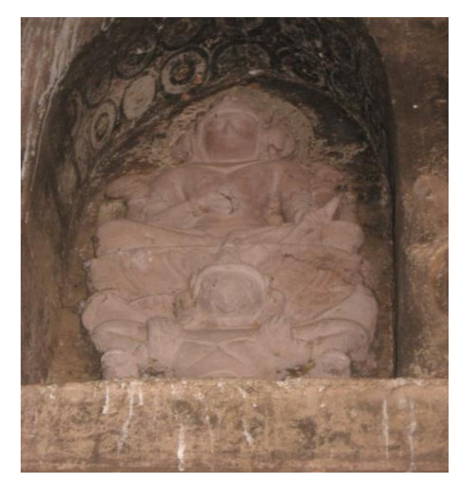
Figure 1. Vishnu at Nathlaung Kyaung, Bagan.