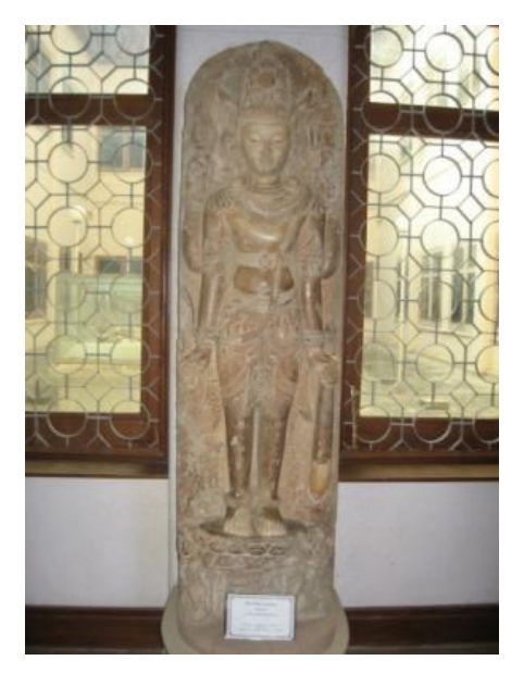
Figure 2. Brick image of the standing four-armed Vishnu at Nathlaung Kyaung, Bagan

With the emergence of primitive economy to feudal economy, the life styles and social patterns changes changed to feudal lords and serf society. Since then, there were sea ports, wharfs and harbors were established in Myanmar riverside. The trade with India became more extensively done and especially with the southern India. Since the emergence of socio-economic changes took place, the penetration of religious faith also existed. The early ideology and belief was Brahmana followed by Mahayana, Hterawada, which were emerged and accepted (Hla Pe 1962, 39). The influence and dissemination of Hindu and Buddhist polities reached to the Southeast Asian countries including Myanmar which made the emergence of building the city states in the early historic periods. And Tambiah noted the religion of Southeast Asia in his work as follow.