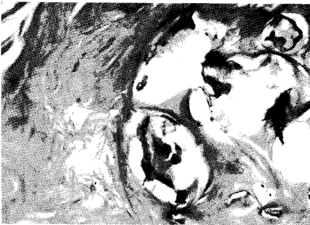
Fig. 5. A high-power view of the fibrocalcific nodule reveals multiple calcium soap-like deposits mainly at the central portion. H-E stain. \times 200 .

ganum infection are needed. Since the route of infection in a Japanese woman was proved to be eating raw carp [7], investigations on fish should also be done.