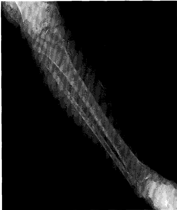
Fig. 1. The plain X-ray of the patient's right leg. Note that multiple calcifications were extending from the medial part of the knee to the calf.