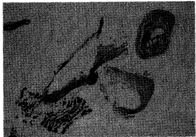
Fig. 4. A tangential cut of a serpiginous tract-like tissue recovered from the calf. It shows several discontinuous fibrocalcific nodules of variable shapes in the musculoadipose tissue. H-E stain. \times 12 .

Sparganosis has shown a gender preference in Korea, i.e., 94