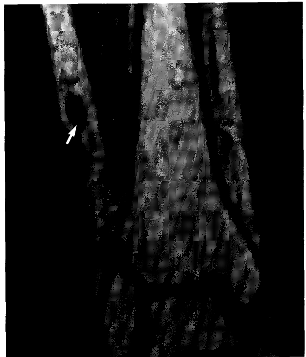
Fig. 2. Low signal intensities (arrow) are observed around the mass lesion with mild enhancement in anterolateral aspect of the right lower leg. T1 weighted image.