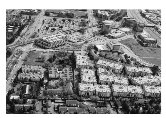
Pleasant Hill BART(2004)

Transit oriented development(TOD) is arguably the most cogent and acceptable form of smart growth. Almost everyone "gets" TOD. Politicians, professionals, and lay citizens alike understand that if there is any logical place to promote compact, mixed-use development, it is in and around transit stations. The benefits of TOD are largely borne out by empirical evidence. People who livenear rail transit stops in the U.S. have much higher rates of transit use than the typical resident of a rail-served region. In California, surveys show that residents who live near a transit station use transit for their commutes at a rate four to five times higher than residents of the same region who don't live near stations. This pattern has held steady over time. In the case of the