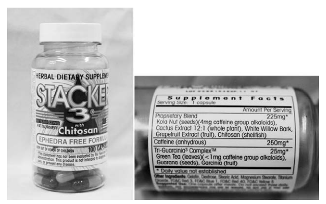
Fig. 1. The photograph of "Stacker 3". This bottle belonged to patient's own. Each "Stacker 3" capsule contains 250 mg of caffeine, and another 225 mg of proprietary mixtures include kola nut, chitosan, green tea, and 25 mg tri-guarcinia complex

caffeine 250 mg/kg) of "Stacker 3" with suicide ideation 2~3 hours ago (Fig. 1). During this 3-hour period, there was no evidence of seizure activity as witnessed by her sister. On admission, she was confused (Glasgow Coma Scale 13), anxious, and diaphoretic with blood pressure 137/70 mm Hg, heart rate 139 beats/minute, respiratory rate 24 breaths/minute, and O2 saturation 98% on room air. There was no sign of injury on physical examination. On neurologic examination, she was irritable and violent. Speech was incomprehensible. She was disoriented to time and place. Both pupils were 4 mm in diameter, equal and reactive to light. Auscultation of her chest revealed clear breath sounds and tachy-