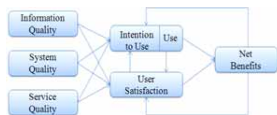
Fig. 1. DeLone & McLean's IS Success Model

DeLone and McLean [5] agreed with Pitt et al. [12]'s premise that service quality was an important variable. They [5] proposed an updated model of IS success by adding a service quality measure as a new dimension of the IS success model. In the new model, quality has three major dimensions: information quality, system quality and service quality. The modified information performance evaluation model could be further applied to evaluate user's satisfaction as well as IS success. Numerous empirical studies tested DeLone and McLean [5]'s IS success model and had found it to be a robust and parsimonious model with high explanatory power of the variance in IS success across a wide variety of contexts including e-government, e-auction etc. [1, 13].