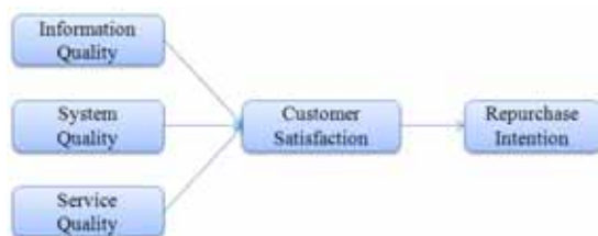
Fig 2. Conceptual Research Model

As we can see from the research model, information quality, system quality and service quality are set as three determining factors that could affect the degree of user's satisfaction. Among it, user's satisfaction and repurchase intention are also included as dependent variables.