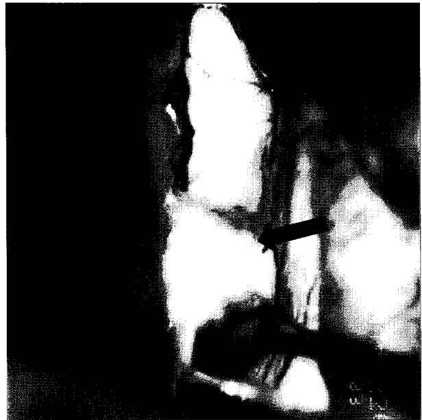
Fig. 5. Aneurysm compressing anterior superior optic chiasm (type C). Dome of aneurysm is sit deeply into the optic nerve (arrow).