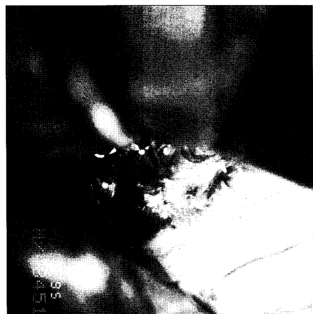
Fig. 6. Surgical color photo shows dome of aneurysm compressing medial portion of optic nerve with focal hematoma.