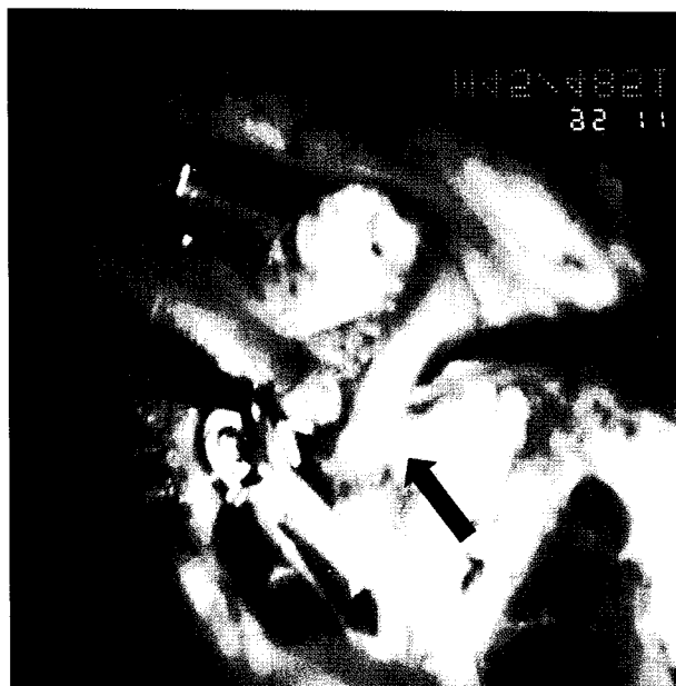
Fig. 4. Surgical color photo shows dome of aneurysm compressing superior portion of optic nerve (type B). Color change of optic nerve due to compression by the aneurysm is seen (arrow).