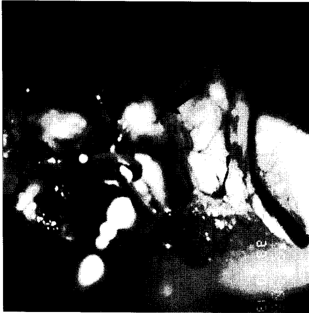
Fig. 3. Surgical color photo shows dome of aneurysm compressing medial portion of the optic nerve (arrow) (type A).

anterior communicating artery aneurysm, during which intracranial aneurysm was found to have protruded onto the superior portion of the optic pathway with localized hematoma around the nerve (Fig. 6). Post-operative improvement of visual defects was found in eight out of ten patients in approximately three months, whereas two patients with giant intracranial aneurysm and unilateral visual loss due to hematoma did not show improvement even up to 1 year following surgery.