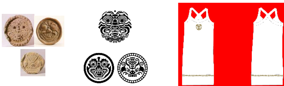
Adult T-shirt 4:White, for women, sleeveless t-shirt that has front neck line and has doggaebi pattern on upper side of trimming. It is decorated with continuous Gokuryu & Goryu doggaebi pattern. This study have designed not only the long sleeve and short sleeve that is popularly sold, but widened to sleeve-less item.