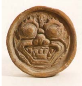
<pic 5> convex eaves-end tile with doggaebi, Gokuryu, Floor, roof, and wall tiles and bricks , p.178.

spirits and receiving good fortune) and doggaebi pattern's origin and history, according to literature data.