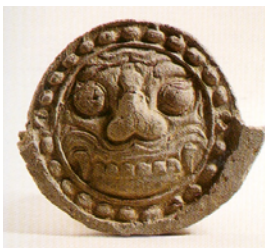
<pic 9> convex eaves-end tile with doggaebi, United Silla, Floor, roof, and wall tiles and bricks , p.183.