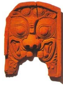
<pic 6> convex eaves-end tile with doggaebi, Gokuryu. Old Roof tiles , p.52