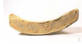
<pic 14> concave eaves-end tile with doggaebi, Goryu Dynasty. Floor, roof, and wall tiles and bricks, p.189.