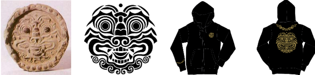
Kids T-shirt 5:Black,for boys. hood shirt with opened front has a little Goryu doggaebi pattern in the left chest and in the back side so it can give an emphasis. This t-shirt was designed to use as a cultural product. Item was expanded to hood t-shirt.