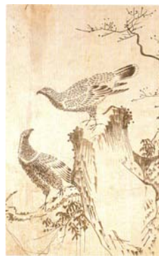
<pic 3> Hawks, KOREAN-Art Book- Folk paingings,p.827.