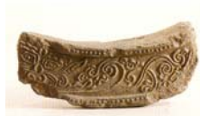
<pic 10> concave eaves-end tile with doggaebi, United Silla, Floor, roof, and wall tiles and bricks , p.186.