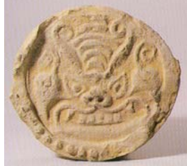
<pic 13> convex eaves-end tile with doggaebi, Goryu Dynasty. Floor, roof, and wall tiles and bricks, p.185.