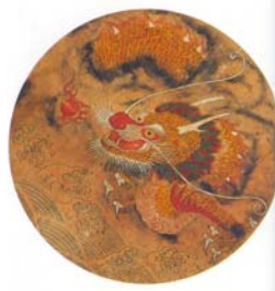
<pic 2> Dragons, KOREAN-Art Book- Folk paingings,p.492.