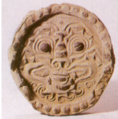
<pic 12> convex eaves-end tile with doggaebi, Goryu Dynasty. Floor, roof, and wall tiles and bricks, p.184.