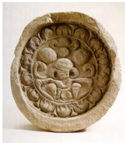
<pic 7> convex eaves-end tile with doggaebi, Old Silla, Floor, roof, and wall tiles and bricks , p.179.