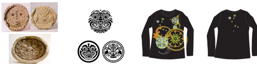
Adult T-shirt 5:Black, for women, It gives variety by using Gokuryu & Goryu doggaebi pattern and lotus and acanthus in bricks. It also place emphasis on the back by arranging little size. This design was made by mixing the 3 kinds of Doggaebi pattern and Wadang, which can be looked as a tryout for future design of mixing patterns.