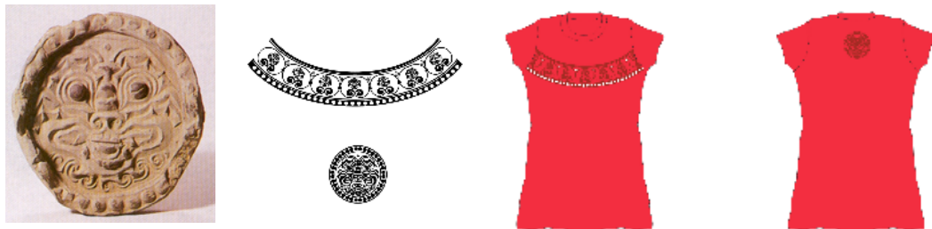
Adult T-shirt 3:Red, for women, In the t-shirt that have waistline and cap sleeves. put demon face pattern in the front chest and gave the point by putting the same pattern under back neck. To reduce strong impression on doggaebi, this t-shirt designed Doggaebi pattern with plant pattern and it was designed with curved line.