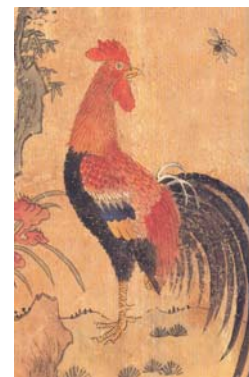
<pic 4> Roosters, KOREAN-Art Book- Folk paingings,p.530.