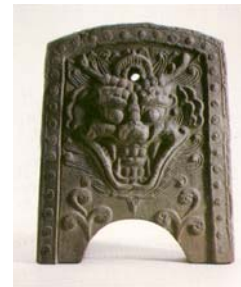
<pic 11> Ridge-end tile with doggaebi, United Silla, Floor, roof, and wall tiles and bricks , p.192.