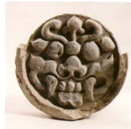
<pic 8> convex eaves-end tile with doggaebi, Old Silla, Floor, roof, and wall tiles and bricks , p.180.