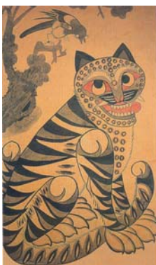
<pic 1> Magpies and tigers, KOREAN-Art Book- Folk paingings,p.461.

Pictures of Magpies and tigers<pic1> 11) are believed to protect people from misfortune if they hang on the wall on New Year's Day. Dragons<pic2> are considered to be a divine spirit and control water so Korean used pictures of dragons in a ritual service to pray for rain. Hawks<pic3> are considered to be a bird of fearless courage and eliminate evil. Korean also