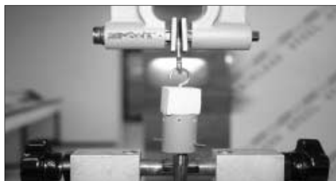
Fig. 1. Test specimen positioned Instron for tensile bond strength.