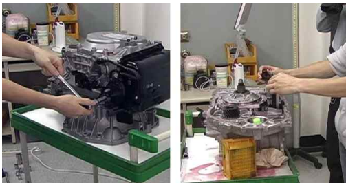
Fig. 3. Conventional disassembling process

In Fig. 4, the structure of proposed augmented reality setup for teaching assembling/disassembling of automatic transmission is shown. It includes automatic transmission, two video cameras connected to desktop computer, two LCD monitors and set of tools. Image of transmission is captured by one of the cameras and sent to the computer. Specially developed software analyze each video frame and augments virtual objects and instructions to it. Finally, resulting frame is displayed on the monitor. Similar is done for the desk of tools. Second camera captures the view of the desk with tools and after all image processing image with tools is displayed on the second screen. Tools which are required during