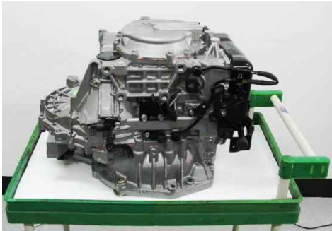
Fig. 2. Automatic transmission from Hyundai Sonata

teaching is uncomfortable, not intuitive and expensive. To solve this problem we propose interactive educational system.