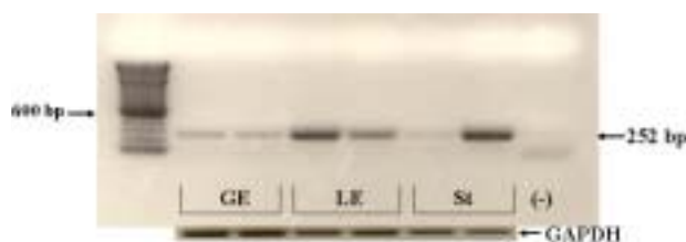
Fig. 4. The expression pattern of IGF-I in different cell types from early pregnant (d 12) uterus. Three major cell types of the uterus were isolated and primary cultures of glandular epithelial (GE), luminal epithelial (LE), and stromal (St) cells were used for RT-PCR analysis. RT-PCR was done by using two independent RNA sets of samples.

the expression of IGF-I message was greater in LE cells than in St cells and the lowest in GE cells, demonstrating cell type-specific expression of this gene (Fig. 4). It suggests that IGF-I is required for E2 induced luminal epithelial cell proliferation, which is most outside layer of the uterus.