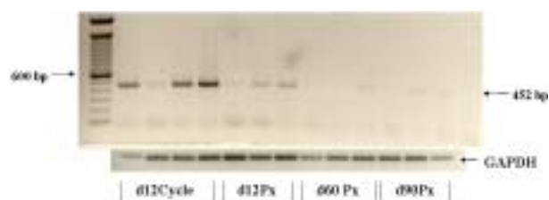
Fig. 1. The expression pattern of ER-α in the uterus during the early- (d 12), mid- (d 60) and late- (d 90) pregnancy and in the cycling (d 12) in pig. (Px and Cycle represent pregnant and cycling, respectively).

In order to examine gene expression of ER-α in the porcine uterus during pregnancy, RT-PCR analysis was performed. The orders of expressions of the pig ER-α gene transcripts were day (d) 12 cycling >> d 12 pregnant (Px) >> d 60 Px > d 90 Px uterus (Fig. 1), where d 12 is a peri-implantation period and d 60 and d 90 are mid- and late-pregnancy, respectively. These results indicate that pre-surge of E2 in cycling uterus and E2 secretion from embryos during early pregnancy enhanced transcription of ER-α in the uterus. In contrast, the expression of ER-α at mid- or late-pregnancy was not observed or minimal. These results imply that P4 from corpora lutea (CL) in pregnant animal diminished ER-α expression in the mid- or late-pregnant uterus. It also explains why the expression of ER-α in d 12 cycling uterus is much higher than the expression in d 12 pregnant uterus. As pregnancy progresses, the concentration of P4, secreted from the newly formed CL, in pregnant uterus is