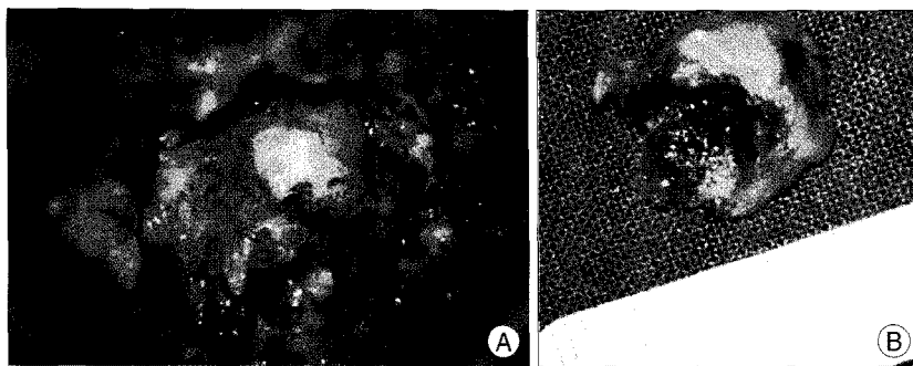
Fig. 3. Intraoperative finding (A) showing total resection through right partial hemilaminectomy and a resected mass (B) 1 cm in diameter showing covering with a thin layer of cartilage.

mass arising from the right C6 lamina with evident cord compression (Fig. 1). Further investigation with computed tomography (CT) demonstrated a sessile bony mass arising from the upper border of the C7 lamina and projecting ventral to the C6 lamina, not arising from the C6 lamina (Fig. 2).