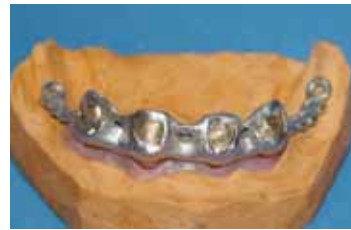
12 Metal framework