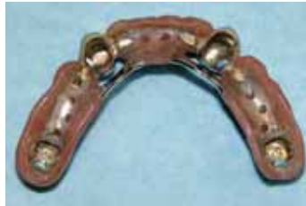
arch - friction - soft