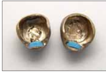
DUP - Friction.2(intra)