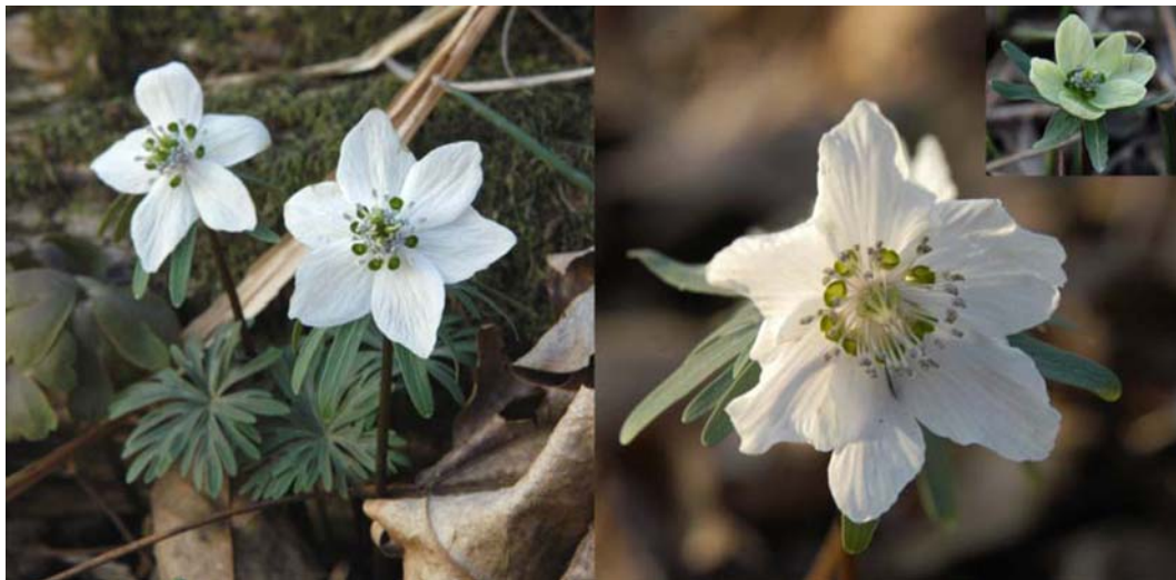
Fig. 2. Photograph of Flowers on Eranthis pungdoensis at type locality.