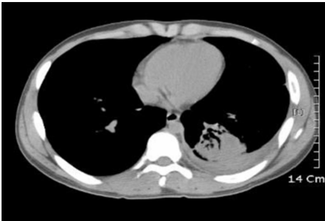
Fig. 3. Transverse contrast-enhanced chest CT scan (10-mm collimation) of the 17-year-old male patient obtained after initial detection of pleural effusion shows a 6-cm diameter of alveolar consolidation with small nodules.

and showed irregular margin with saccular changes (Fig. 2B). We concluded that this consolidation was due to a paradoxical response to antitubercular agents for pleural effusion and decided to continue the original drug regimen. The treatment was completed after 6 months from the initiation of therapy and the newly developed pulmonary lesion gradually disappeared gradually 10 months after the disease onset (Fig. 2C).