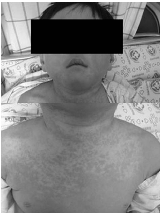
Fig. 1. Maculopapular rash on the face, neck, and trunk at three days after exposure to the contrast media Ultravist ® (iopromid).