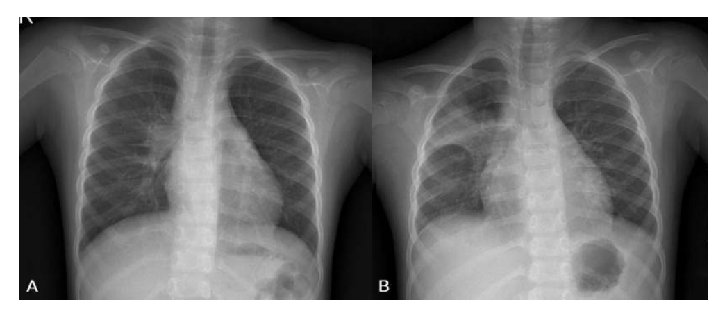
Fig. 2. (A) Chest roentgenogram (CXR) on the day of admission showed increased lung markings on the right perihilar area. (B) CXR on hospital day 7 showed more increased extent of dense consolidation on the right upper lobe.