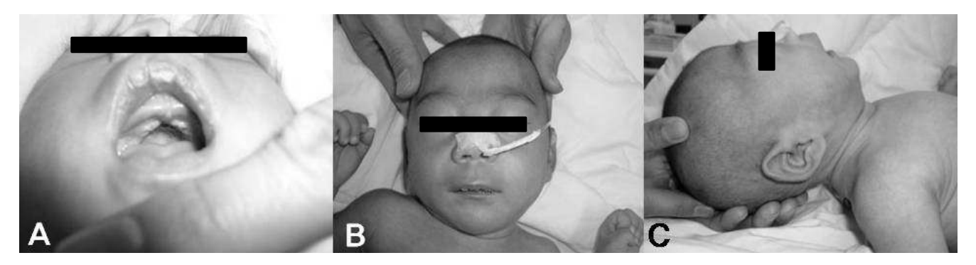
Fig. 1. (A) Unusual round-shaped palatal cleft with incomplete closure of the palate secondary to posterior displacement of the tongue. (B) Frontal view of the face. (C) Lateral view of the face.

mally positioned. The external genitalia were normal (Fig. 1). The skeletal X-rays showed no anomalies.