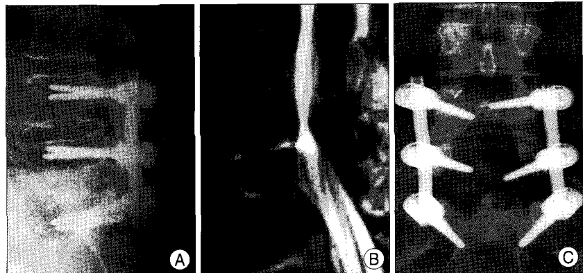
Fig. 2. Adjacent segment degeneration (ASD) occurred at 5 years after primary surgery. On plain radiographs, there are no evidences of ASD such as disc space narrow and segmental instability at L3-L4 (A) but clinically significant spinal stenosis confirmed by magnetic resonance image (B). The patient implanted interspinous device on L3-4 (C).

We also found that there was no difference in ASD incidence in patients undergoing the circumferential fusion