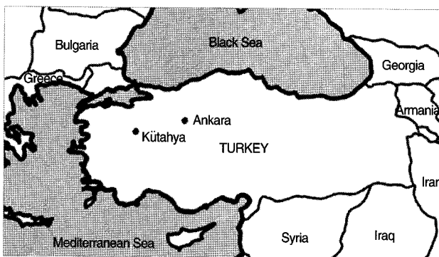
Fig. 1. A map showing the city of Kutahya in Turkey.

Sera that had been tested for presence of HDM sensitization were kept for SM sensitization studies in sterilized 1 ml tubes with eppendorf tubes at -86°C deep freezer (Revco). At a later stage, these samples were defrosted once and centrifuged to be made ready for the new testing. In the tests, specific IgE for A. siro , G. domesticus , T. putrescentiae , and L. destructor were searched in sera of 92 children; 41 of them were found previously to have specific IgE against at least 1 of D. pteronyssinus and D. farinae antigens, while the remaining 51 children were found negative.