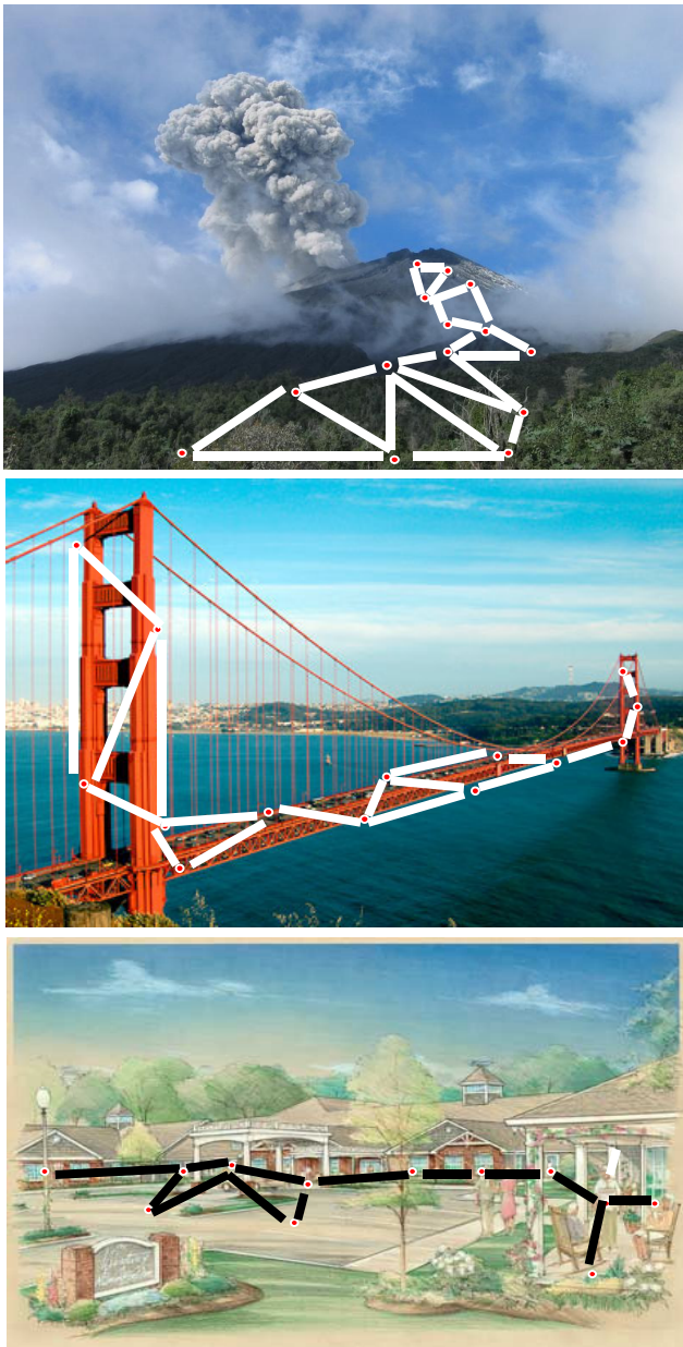
Fig. 1. Three important applications: volcano monitoring, bridge monitoring, and assisted living.

properties. Nevertheless, most real-time systems are embedded and vice versa.