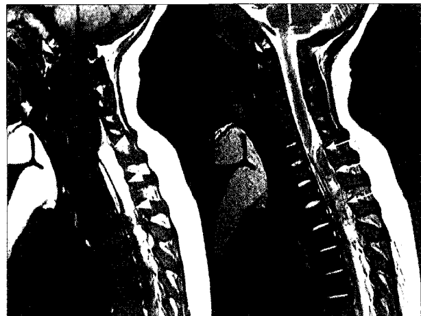
Fig. 1. Initial sagittal magnetic resonance imaging demonstrating a posterior, extradurally lobulated contour from the 7th cervical spine to the 4th thoracic spine, which is seen as a high signal intensity lesion (arrow heads) on the T1 weighted image and low signal intensity lesion (arrows) on the T2 weighted image.

Most reported cases of SSEH in the literature occurred in adult. Only 35 pediatric cases have been previously described reported in the past literature, and among them only 13, including our case, have been reported in infants 6,29) , and there is no sexual preponderance in toddlers (Table 1) 8,21) .