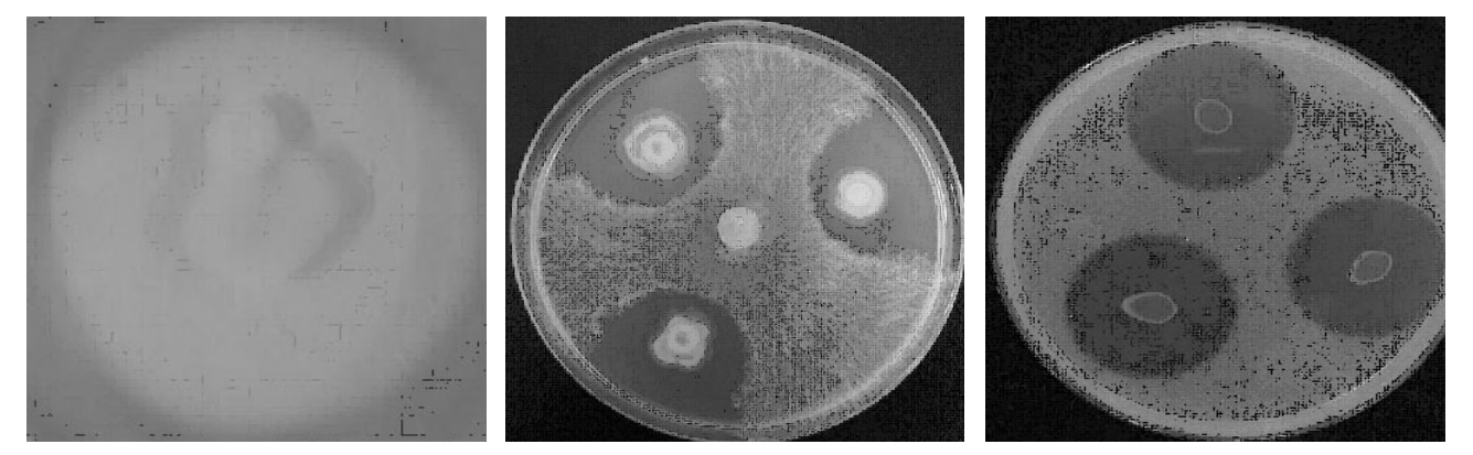
Fig 1. a) Siderophore production on chrome azurole S agar. b) Inhibition of Rhizoctonia solani on Potato dextrose agar. c) Zn solubilization on Pikovaskya's medium supplemented with 0.1% ZnO, respectively by Pseudomonas sp. PRGB06.

Similar to the present investigation, Trivedi et al. (2007) found that the volatile metabolite(s) produced by P. corrugata (HCN, cellulose, pectinase negative and ammonia positive) had a predominant inhibitory role in the antagonism of the test fungus F. oxysporum . The role of ammonia in antagonism has been well documented and it has been reported that it is the only gas present in sufficient concentrations in soil to inhibit soil fungi (Pavlica et al., 1978). Inhibition of pathogenic fungi