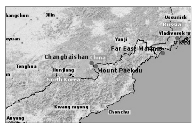
Fig. 1. Map of locations of Mt. Changbai Nature Reserve and Mt. Paekdu Nature Reserve.

structure and function have a profound effect on the ecosystem of that area. The dominant tree species, Korean pine, is very important natural resources for its great ecological and economical values. The seeds of Korean pine are the basis for the regeneration of Korean pine and