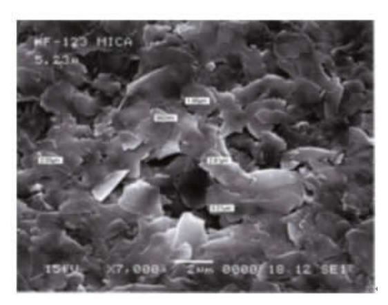
Fig. 1. Electron microscope photograph of sericite

It was showed that the salt fog resistance could be greatly improved when sericite was added to the coating. It was because that the sericite crystal took on 2D sheet, no matter thin to what extent. Sericite laid parallel in the coating, thereby prolonging water vapor infiltration trails; Additionally there were active hydroxyl groups in sericite, which were easy to combine and wrap with the molecular chain of reactive diluents, then paralleled and overlapped in the coatings. So a dense layer network structure was