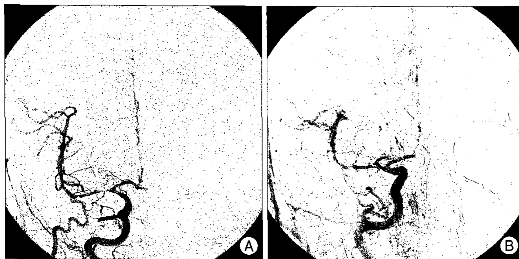
Fig. 3. Transfemoral catheter arteriograms on postoperative day 14 show a moderate vasospasm on the right proximal middle cerebral artery and proximal carotid artery (A). Note the resolution of vasospasm following intra-arterial nimodipine injection and prominent flow through the posterior communicating artery channel (B).