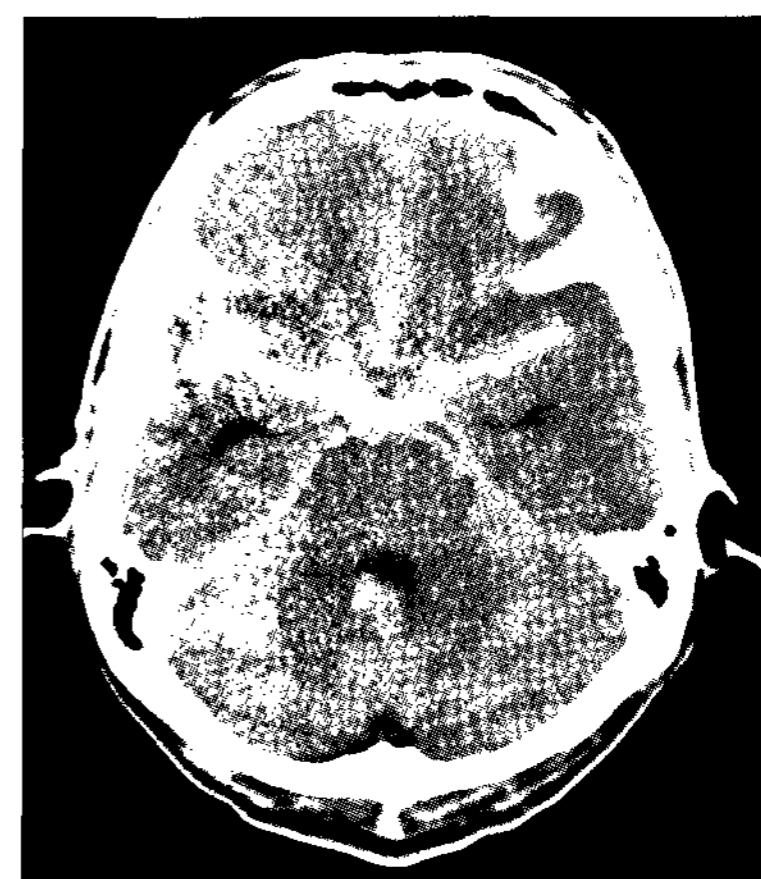
Fig. 1. Non-enhanced axial computed tomogram shows diffuse subarachnoid hemorrhage, with slightly thicker hemorrhage on the right Sylvian fissure.

On postoperative day 14, it was noted that the patient became obtunded and left hemiparetic (Grade 3/Grade 4), but a brain computed tomography (CT) scan revealed no pathologic findings within the brain. Subsequent catheter angiograms showed a moderate