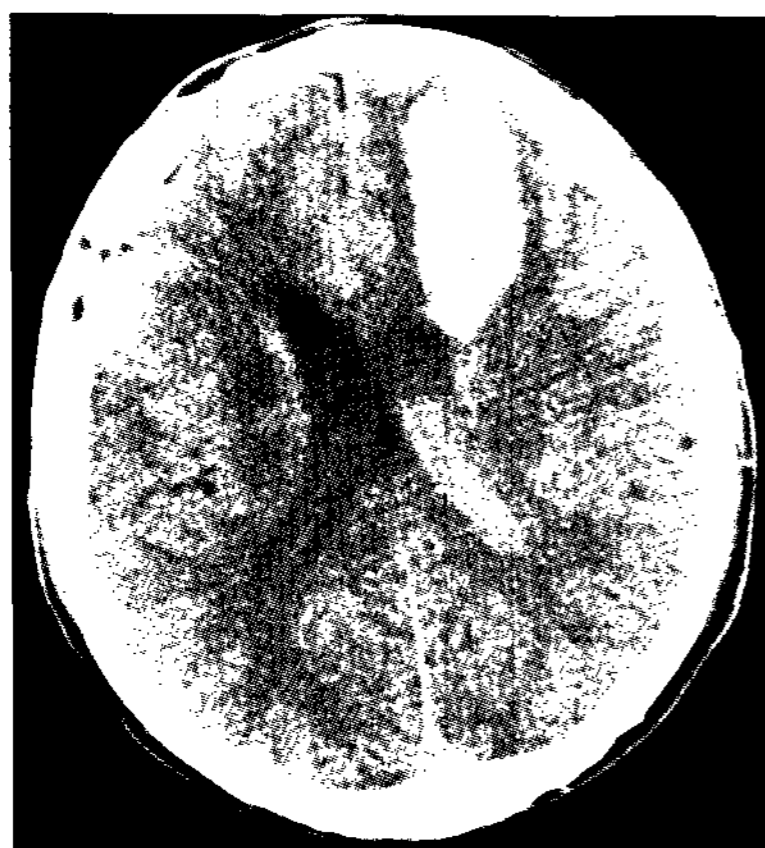
Fig. 4. Brain computed tomographic scan on postoperative day 21 shows a wedge-shaped intraparenchymal hemorrhage on the left anterior border-zone with mass effect.

4 L/day of intravascular fluid, and induced-hypertension with dopamine and dobutamine were provided. The patient gradually regained motor power up to the baseline level. Transcranial Doppler ultrasonography was performed twice,