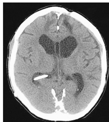
Fig. 5. Postcranioplasty axial computed tomographic scan showing the restoration of midline shift without significant complications of underlying brain and subdural space.

The cranioplasty was performed, using the previous original sterilized bone flap three days after the V-P shunt. After operation, the patient mentality improved gradually to alert state and achieved good functional recovery. The follow-up CT scans images showed the restoration of midline shift without significant complications of the underlying brain (Fig. 5).