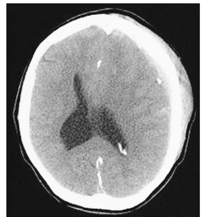
Fig. 1. Preoperative axial computed tomographic scan showing the acute subdural hematoma on the left frontotemporoparietal region and traumatic intraparenchymal hematoma on the left frontal region with extensive midline shift to the right.

A 37-year-old man was transferred to our neurosurgical department through a local hospital with semicomatose mentality that had developed due to head injury at work. The brain computed tomographic (CT) scans showed acute subdural hematoma on the left frontotemporoparietal region and traumatic intracerebral hematoma on the left frontal region with significant mass effect and extensive midline shift to the right (Fig. 1). An emergency left frontotemporoparietal decompressive craniectomy for hematoma evacuation was performed. The patient gradually recovered and was nearly alert enough to obey command. Postoperative follow-up brain CT scans one week later showed a resolution of previous subdural hematoma and restoration of significant midline shift