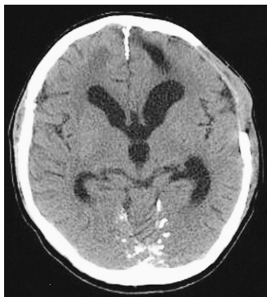
Fig. 3. Postcraniectomy axial computed tomographic scan four weeks later showing the enlargement of the ventricular system and the persistent bulging of craniectomy site.