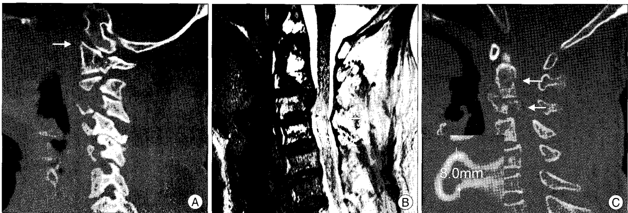
Fig. 1. Preoperative radiologic findings. A : The fracture of the left lateral mass on initial computed tomography is comminuted and causes fracture/subluxation of the left atlanto-occipital joint(arrow). B : The cervical magnetic resonance image showing signal change on T2 weighted image at C2-C4 level with mild compression of the spinal cord by displaced C2-C3 segments (arrow). C : The Type 3 odontoid process fracture with comminution and fractures of C3 body and lamina causing subluxation at the C3/C4 (arrows). The junctional height of bilateral laminae and spinous process is 8.0 mm.

A laminectomy was performed at C3. After decompression of the level of noted signal change on preoperative MRI, the lateral masses were marked. The 14 mm lateral mass