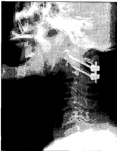
Fig. 2. Postoperative lateral radiograph.