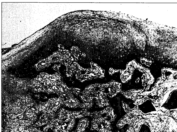
Fig. 3. The nodules show hyaline cartilage covered by synovial cells, and ossifications ( \times 200 ).

flexor carpi ulnaris and a medial epicondyle, but several authors reported that cubital tunnel syndrome is unusually caused by a mass compressing ulnar nerve 7 . Kato et al. 7 reported that medial elbow ganglia are associated with osteoarthritis of the elbow and can also cause acute onset of cubital tunnel syndrome and the prevalence of this lesion among patients with cubital tunnel syndrome is about 3 to 19%. Other report have shown that the compressive ulnar neuropathy is caused by synovial chondromatosis like this report 9 . Most masses causing cubital tunnel syndrome are found on the operative fields, though a rare synovial chondromatosis is detected on the preoperative simple X-ray 9 .