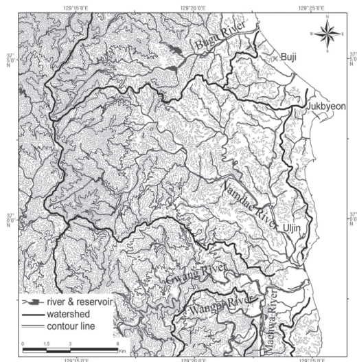
Fig. 1 Topography of the drainage basin of Uljin Namdae-cheon(river) and its estuary (contour intervals are 50m).

The watershed of Uljin Namdae-cheon is consist of ridges about 900m a.s.l. joined from Eungbong mountain (1,000m) that forms boundary between Uljin, North Gyeongsang Province and Samcheok City, Kangwon Province. The river flows southeast into middle part of the East Sea. The channel extension is about 25km