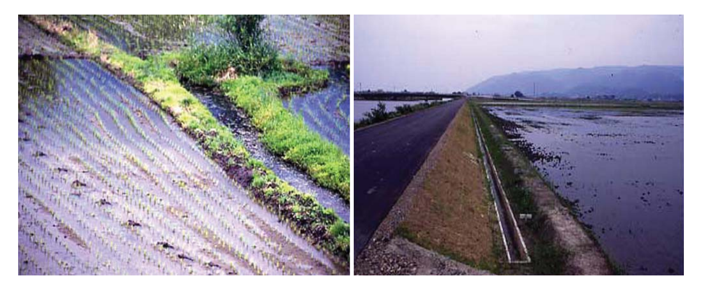
Fig. 1. Comparison of landscape with irrigation ditch between traditional paddy field (left) and consolidated paddy field (right) in Gifu Prefecture.