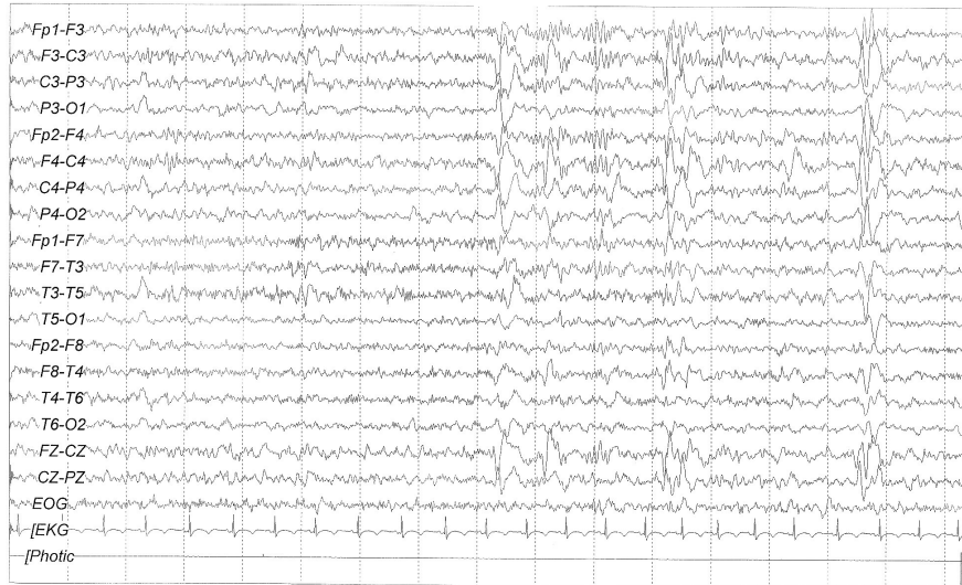
Fig. 1. Interictal EEG showed a generalized burst of spikes and slow complex waves, predominantly on both frontocentral areas.