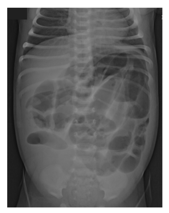
Fig. 1. Abdominal X-ray showing distended bowel loops suggesting small bowel obstruction.