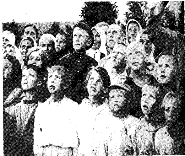
Fig. 1. kino eye (kinoglaz)

From this point of view, Vertov emphasized that filmmakers and cineaste should play 'new roles' in making 'new films' beyond conventional out-of-date practices (of 'art film' in his contemporary era) to keep up with Russian Revolution for building new socialism. So neither story nor narrative may be allowed in film, let alone scenario-based mimetic performance and dramaturgic behaviors at indoor stage. As a result, traditional literary and dramatic aspects become excluded from film even without any fictional nature.[3] Instead, Vertov adopted documentary film in newsreel format of on-site topics to communicate and inform knowledge about life and world in pursuit of fact and reality, so that he could seek to achieve both human development and social construction and implement and maximize independent specialty and functionality of film as a media.