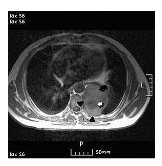
Fig. 1. T1-weighted axial MR image shows a mass lesion with intermediate signal intensity in paraspinal region. Central portion(white arrow) of mass has a somewhat lower intensity than does peripheral portion (black arrow). The mass erodes vertebral body and rib(black arrow heads).