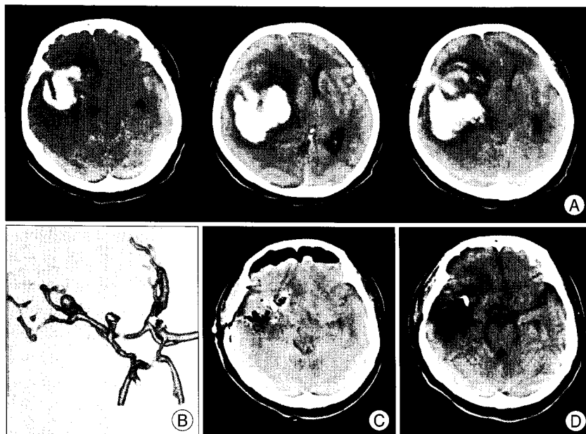
Fig. 3. A 57-year-old woman presenting with semicomatose mental state and right side anisocoria without light reflex. A: Brain computed tomography scan shows huge right temporo-parietal intracerebral hematoma. B: CT (computed tomography) angiogram demonstrates a right middle cerebral artery bifurcation aneurysm measuring 12.0 \times 5.7 mm in size. C: Immediate postoperative CT scan reveals evacuation of the hematoma. D: One month later, CT shows infarction in the right temporal lobe.

ICH constitutes a less frequent manifestation of aneurysm rupture than SAH. Its incidence in patients with ruptured aneurysm varies from 4% to 35% 7,15,16 . Certain patterns of collections of blood seem to be related to specific aneurysmal locations. It is well known that: 1) middle cerebral artery and posterior communicating artery aneurysms will predominantly cause intratemporal clots, with possible extension into the adjacent lobes; 2) anterior communicating artery aneurysms will most likely produce fronto-basal hematomas; and 3) anterior cerebral artery aneurysms will mainly cause interhemispheric clots. Shimoda et al. 20 found that favorable outcomes in patients with ICH and diffuse SAH was lower than for patients with ICH alone. They suggested that ICH caused by bleeding of aneurysm directly into the brain parenchyma from the sac adhered to the pia mater was fundamentally a subcortical hemorrhage. Patients with temporal or