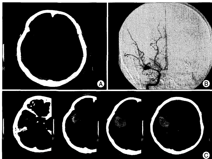
Fig. 1. A 51-year-old woman presenting with Hunt and Hess (H/H) grade III. Initial CT (computed tomography) shows subarachnoid hemorrhage in the right sylvian cistern (A), and carotid angiogram demonstrates severe vasospasm and a right middle cerebral artery bifurcation aneurysm (B). Brain CT after rebleeding (H/H grade IV, C) shows large intracerebral hematoma in the right fronto-temporal area.

Group A : aneurysmal subarachnoid hemorrhage (SAH) associated with large intracerebral hematoma (ICH), January, 1994–December, 1999. Group B : aneurysmal SAH associated with large ICH, January, 2000–May, 2005. All clinical variables are not significantly different between two groups (t-test for age, hematoma volume, and size of aneurysm, \chi^2 test for other variables). Data are expressed as the mean ± the standard error. ACA : anterior cerebral artery, MCA : middle cerebral artery, ICA : internal carotid artery, Pcom : posterior communicating artery