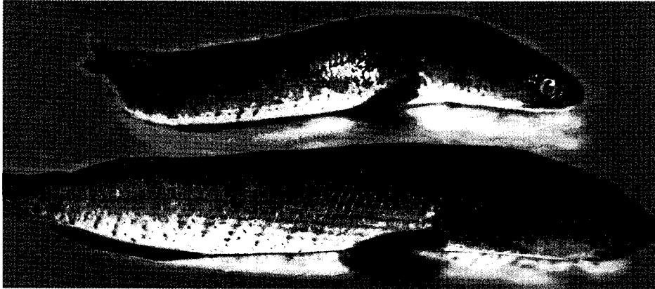
Fig. 1. The snakehead fish (15-20 cm long), Channa striatus , purchased from a central part of Myanmar.

tially broken larva with an intact head part was washed 3 times with physiological saline (pH 7.2) and fixed in 2.5% glutaraldehyde at 4°C. After 3 washings with this buffer, the larva was