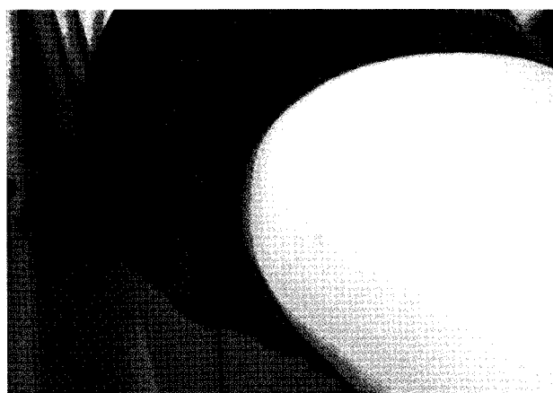
Fig. 2. Skin rashes of the patient due to bedbug bites.