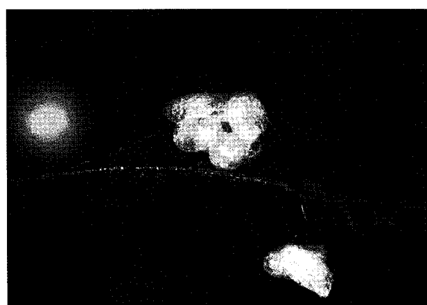
Fig. 4. Bedbug eggs ( \times 80 ).

The bedbug is one of the medically important insects. Confirming the diagnosis of a bedbug bite is sometimes difficult unless to obtain a detailed history of the home environment. However, bedbugs are not considered a serious disease threat.