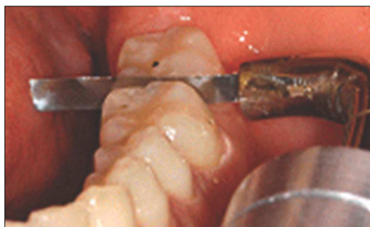
Fig. 2. Measurement of the tightness of proximal tooth contact between the left first molar and second molar in mandible.

As pushing the starting button, the metal strip was removed by constant speed. The highest value of the frictional force which was occurred during removal was considered the TPTC. This trial was repeated five times at same proximal contact area. Among these values, the highest and the lowest values were excluded, and then the mean value of the three measured values was determined as the representative value in each contact area. Measurement was operated at rest state and the subjects were restricted not to be occlude during measurement. Between each measurement, there was more than 2 minutes of rest