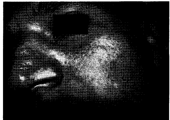
Fig. 4. The patients after 1 yr of follow-up showing complete healing of the lesion.

tion of the treatment. We treated the patient with a combination therapy of topical TCA and systemic glucantime. After cleansing with alcohol, TCA (Merck, Berlin, Germany) (50% wt/vol) [7] was applied to the lesion using a cotton swab, and after frosting, the lesion was covered with vaseline (Fig. 2). There was no need to wash off any TCA from the lesion. TCA was applied once weekly for 3 wk. In addition, the patient was treated with systemic glucantime at 20 mg/kg/day for 20 days. The responses to the treatment were good, and the marginal nodules disappeared (Fig. 3). The patient was followed-up for 1 yr and showed no signs of recurrence.