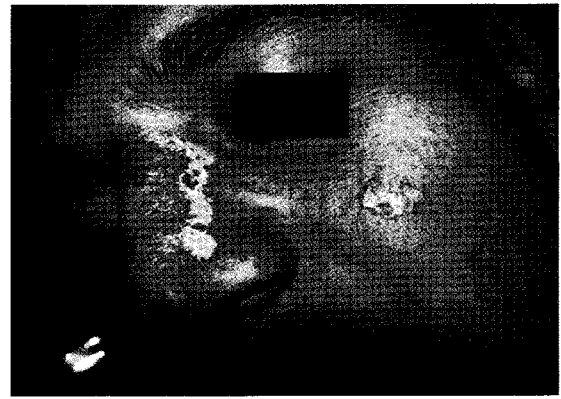
Fig. 3. Frosting the lesion after application of 50% TCA solution.