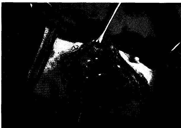
Fig. 1. An adult Dirofilaria immitis was found in the abdominal cavity of a dog during spaying.

merase, which was followed by 30 cycles of denaturation at 94°C for 30 sec, annealing at 55°C for 40 sec and extension at 72°C for 50 sec. A 5- \mu l sample of the PCR products was then analyzed by electrophoresis in 0.8%-agarose gel followed by ethidium-bromide staining and photography. PCR analysis for an adult worm revealed a heartworm DNA-positive reaction (Fig. 2). Therefore, it was also confirmed that the worm detected in the abdominal cavity was D. immitis by PCR analysis.