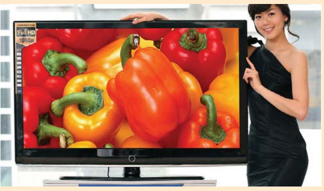
specific patterns, display measurement method considering the characteristics of human visual recognition, etc.

At the seminar, the latest standards technologies were introduced, including measurement method of HDTV's power consumption, proper evaluation method for image signals in accordance with display size and resolution, subjective analysis and measurement method through